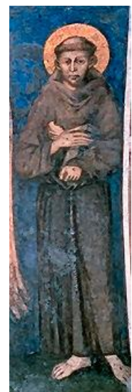
St. Francis of Assisi

For it is in giving that we receive, It is in pardoning that we are pardoned, and it is in dying that we are born to eternal life.